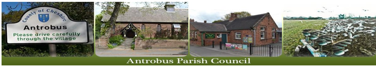
Antrobus Parish Council

these hours which they insist are rare and not a regular occurrence – No further action at this time.