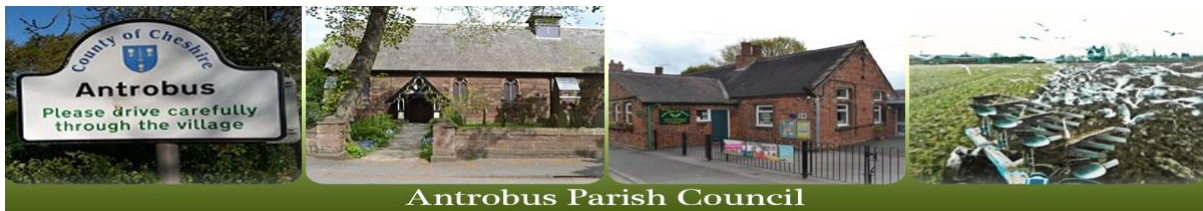
Antrobus Parish Council